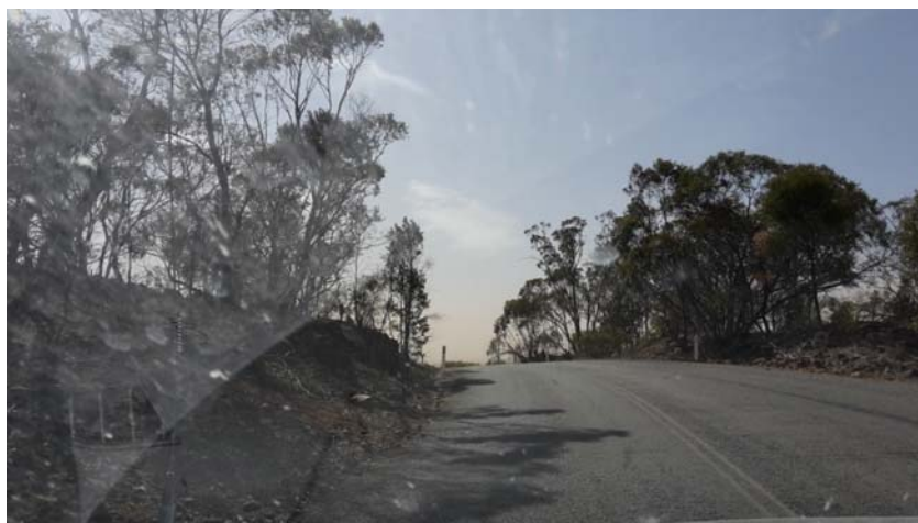
Serious sight distance issue on sharp bend at crest