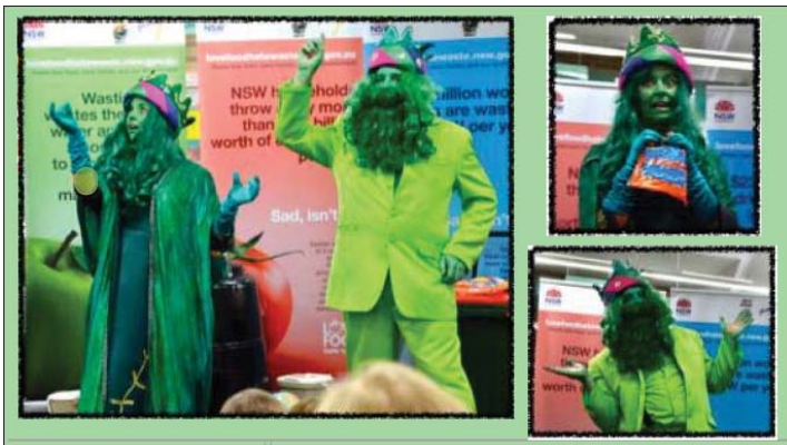
The King and Queen of Green